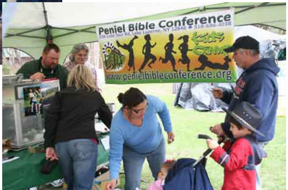
Photo below: Peniel Bible Conference information booth at Maplefest. Raffle .