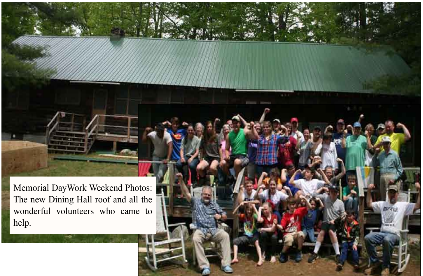
Memorial Day Work Weekend Photos: The new Dining Hall roof and all the wonderful volunteers who came to help.

Memorial Day Work Weekend involved many helping hands from the local area as well a large group from Maine. The Hill and Pine cabins were cleaned, swept and furnished with new mattresses. Many of the roofs were swept of pine needles. And speaking of roofs, the new dining hall roof was completed with a green metal roof and has provided us with a water tight dining area! No more concerns about rain drops in the salad! It looks marvelous among the pines.