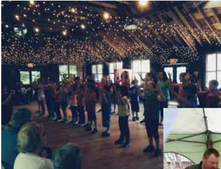
Photo at Left: Praise Camp performance for the senior citizens of Lake Luzerne and Hadley.

Redeemer Reformed Women's Retreat in May was a blessing for about 20 women who came to grow closer to God, study His Word, enjoy the natural surroundings and spend time in fellowship with each other. Many compliments were shared about the wonderful lodging and presentation of meals and snacks.