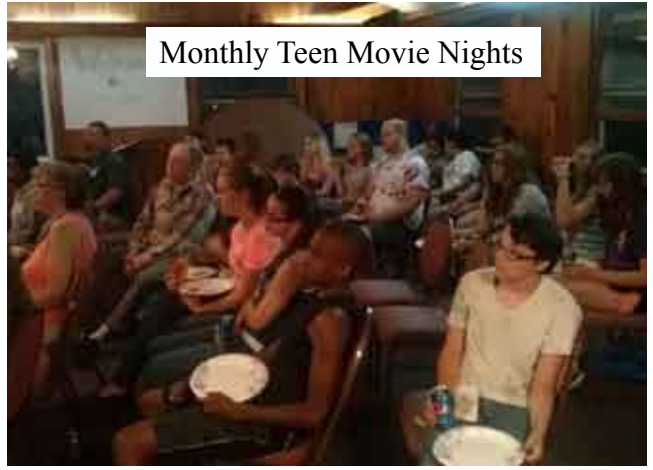
Monthly Teen Movie Nights

9/6 Wilderness Teen Movie Night 7m 10/3 & 4 Prayer Council Meeting 10/10 – 13 Adult Retreat & Alumni Weekend " Be a Kid Again " 10/10 – 13 King School - Class Reunion 10/30 Campus CLOSED 11/14 & 15 Ladies Retreat - Adirondack Christian Fellowship 11/29 Wilderness Teen Night - La Cafe 2/15 & 16 Jr. Snofun - Frozen 2/20 – 22 Sr. Snofun - Mt. Everest 4/1 Campus OPEN 4/17&18 Teen Spring Event ( name & theme TBA ) 4/24 & 25 Prayer Council Meeting 5/1 – 3 Ladies Retreat - Redeemer Reformed 5/22 – 25 Memorial Day Work Weekend 6/2 - 6 Americade - CMA Riders 6/12 – 14 & 6/19 – 21 ARC Lifeguard Training (Full Cert) 6/15 – 6/19 ARC Lifeguard Training (Re-Cert) 7/5 – 8/28 ARC Learn to Swim Program 7/5 – 11 Staff Training Week 7/12 – 18 Children's Camp ( name & theme TBA ) 7/19 – 25 Junior Camp ( name & theme TBA ) 7/26 – 8/1 Family Camp & Day Camp ( name & theme TBA ) 8/3 – 7 Growth In Truth - Union with Christ 8/7 & 8 Prayer Council Meeting