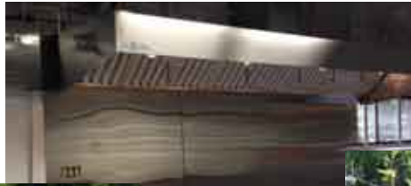
Lto R: Old pool liner, New pool liner, New Ansul, Replaced Water line