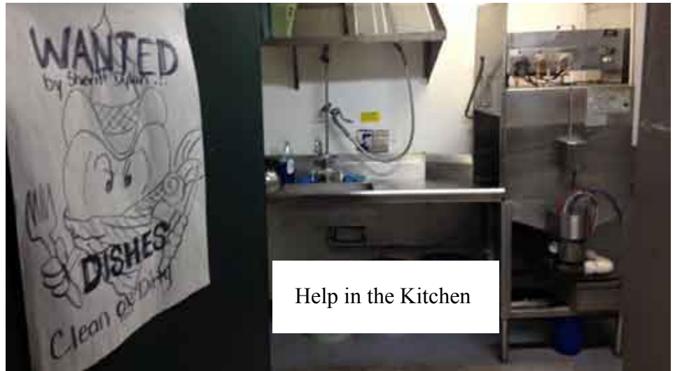
Help in the Kitchen