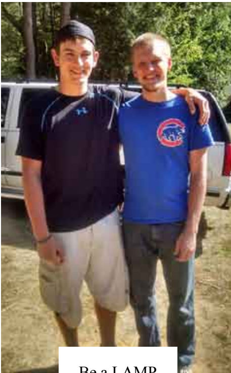
Be a LAMP