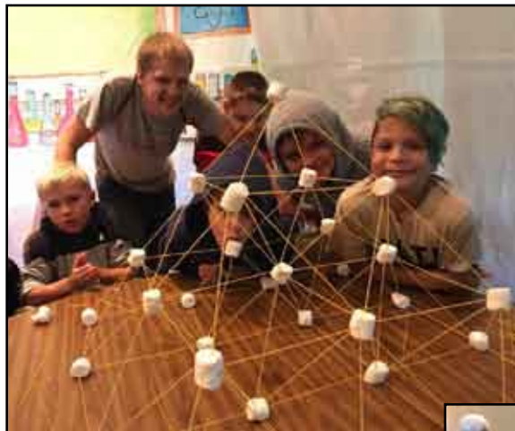
Day Camp: At Left: Building the tallest structure possible out of spaghetti & marshmallows. Below: using the airzooka gun to demonstrate how the air (God) that we cannot see has a great ability to move things we can see.

Our first camper session was the Middle School Camp with 33 young people. The theme was